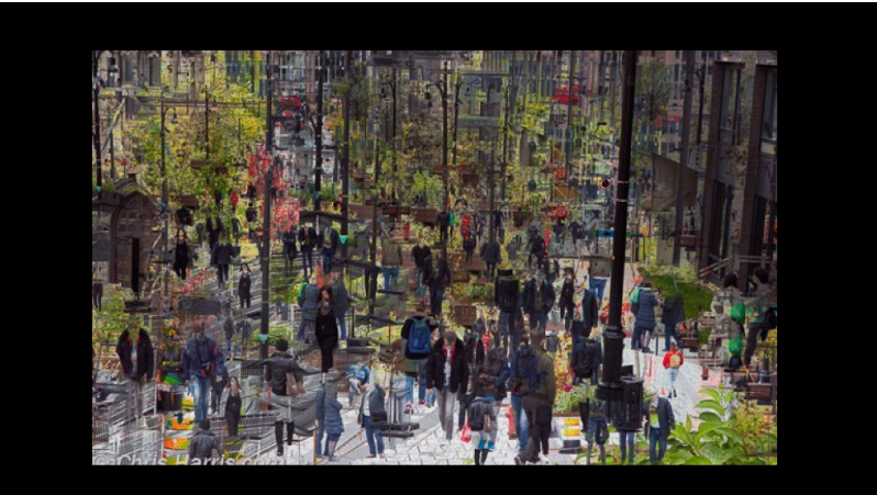
"For me, this 'multiple perspective' photograph portrays the vibrant exchange of energy in the modern-day city of Montreal."